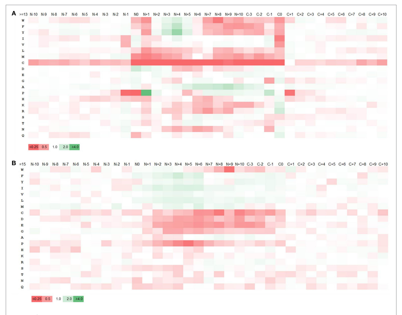
FIGURE 2 | Enrichment and depletion of amino acids within and adjacent to major histocompatibility complex (MHC) II ligands and predicted MHC II binders. Heatmaps generated from the relative frequencies of amino acids at ligands/binders and nearby positions with respect to the overall amino acid frequency of the source proteins. "N" and "C" represents the N- and C-terminuses of the ligands, respectively and the numbers represent the amino acid positions with respect to N- and C-terminuses. The legend shows the color scale of the heat map with respect to the relative frequency of amino acids which is represented by the numbers on the legend. (A) Heatmap generated from ligands. (B) Heatmap from predicted binders. The pattern of amino acid enrichment and depletion was found to be significantly different between the heatmaps generated based on cleavage motif and binding motif.

being favored over others at the cleavage sites at the start and end of MHC ligands. Accordingly, the amino acid composition of the ligands and adjacent regions was analyzed. The sequence regions analyzed included 10 residues prior and past the N- and C-terminuses of each ligand including residues at both termini. The frequency of the amino acids at each position was computed and the pattern of enrichment/depletion was analyzed by comparing it to the amino acid frequencies in the source proteins overall. As most ligands are ~15 residues in length, going in 10 amino acids from either terminus means that the enrichment/depletion motifs are expected to overlap, and in fact they do. Figure 2A shows the enrichment and depletion of amino acids at positions from the N-terminus ±10 positions; the C-terminal enrichment is shown from positions -3 to +10, because positions C-4 to C-10 from the C-terminus show essentially the